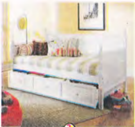
Casey daybed in white by Fashion Bed Group ($569, www.justdaybeds.com ).