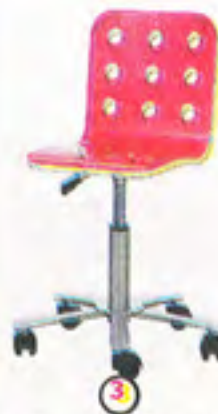
Jules junior desk chair in pink/silver ($40, www.ikea-usa.com ).