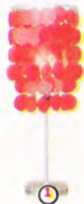
Portfolio pink coin shade table lamp ($27, www.lowes.com ).